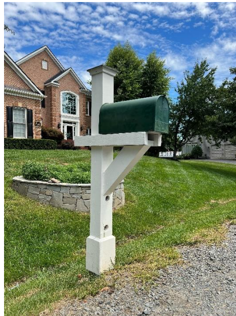
Example of mailbox post with a proper collar.

Homeowners may wish to have a collar at the bottom of their mailbox post (ground level) which is permitted but must be properly maintained in order to be compliant with these guidelines.