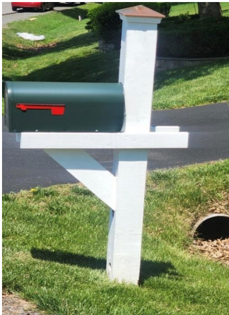
Example of mailbox and post style and color

The mailbox color can be matched with "Rustoleum High Performance Enamel Spray" paint in Hunter Green (#7538) and is also available at Lowe's and Home Depot.